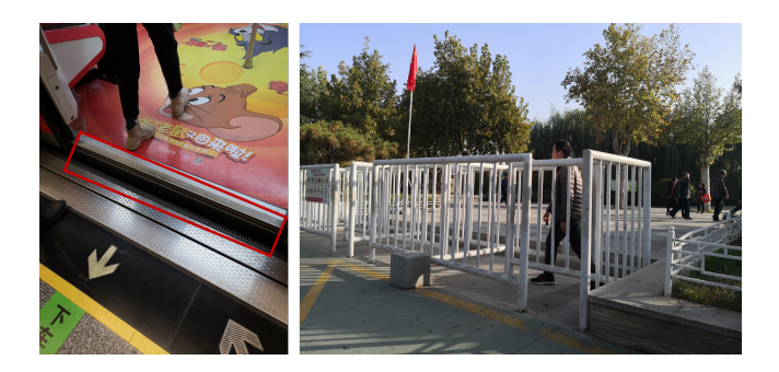
Figure 3: (Left) Local subway system has a gap of over 100 mm between the train and the platform which can decrease the accessibility of the subway system to wheelchair users; (Right) the entrance gate of a park blocks wheelchair users.

A Study on Perceptions of Accessibility and Assistive Technology Use Conducted in China