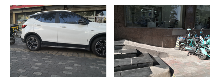
Figure 1: Misuse of accessibility infrastructures by members of the general public. Left: the tactile paving was blocked by the car. Right: the ramp was blocked by locked electrical bikes.

who have insurance or subsidy to buy ATs explicitly mentioned that the subsidy coverage is often restricted to certain brands or models of ATs , which may not necessarily match their needs. P8 commented on this: