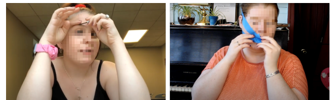
Figure 2: Left: A person uses her hand to guide a brow gel applicator onto their eyebrow. Right: A person uses painter's tape on their cheekbone to help apply contouring.

In some cases, visually impaired individuals asked other people for help during makeup processes. We found that they sometimes ask for help with specific makeup steps , such as eyeliner or mascara that requires more precision and depth perceptions (e.g., V2, V4, V35). The content creator of V35 commented: “I normally would have someone to do eyeliner for me because I cannot do it very well myself.”